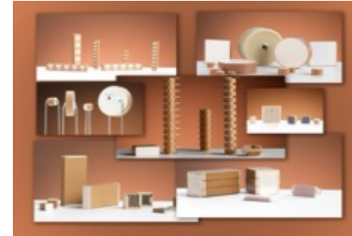
Bare Ceramic Devices