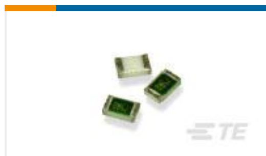
TE Part #8-1879214-2 CPF 0402 2K61 0.1% 25PPM 1K RL