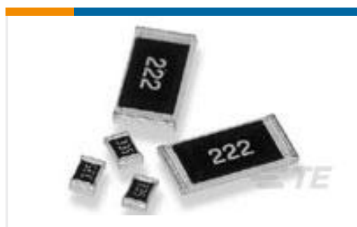
TE Part #1623251-1 CRG0805 1% 560K