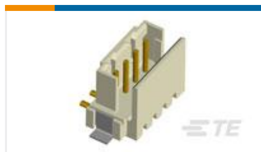
TE Part #292174-2 CT BOX HDR V SMT 2P O/TAPE NAT