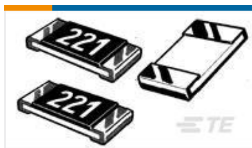
TE Part #2-2176071-2 3521 1M0 1% 2W