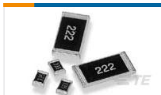
TE Part #2-1879501-9 CRGH2512 5% 15R 2W