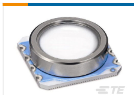
TE Part #325540009-00 MS5540-CM 1BAR WHITE GEL TUBE