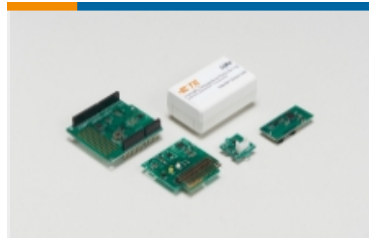
Digital Component Sensors(4)